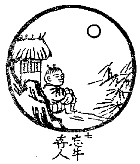
7 - The Bull Transcended

Even that joy and color becomes irrelevant. The Mahamudra mandala of symbols and energies dissolves into Maha Ati through the total absence of the idea of experience. There is no more bull. The crazy wisdom has become more and more apparent and you totally abandon the ambition to manipulate.