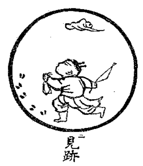
2 - Discovering the Footprints

The inspiration for this first step, which is searching for the bull, is feeling that things are not wholesome, something is lacking. That feeling of loss produces pain. You are looking for whatever it is that will make the situation right. You discover that ego's attempt to create an ideal environment is unsatisfactory.