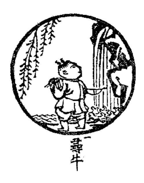
1 - The Search for the Bull

The inspiration for this first step, which is searching for the bull, is feeling that things are not wholesome, something is lacking. That feeling of loss produces pain. You are looking for whatever it is that will make the situation right. You discover that ego's attempt to create an ideal environment is unsatisfactory.