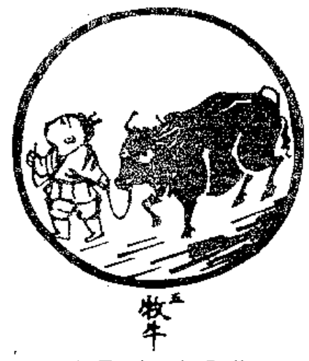
5 - Taming the Bull

Once caught, the taming of the bull is achieved by the precision of meditative panoramic awareness and the sharp whip of transcendent knowledge. The Bodhisattva has accomplished the transcendent acts (paramitas) - not dwelling on anything.