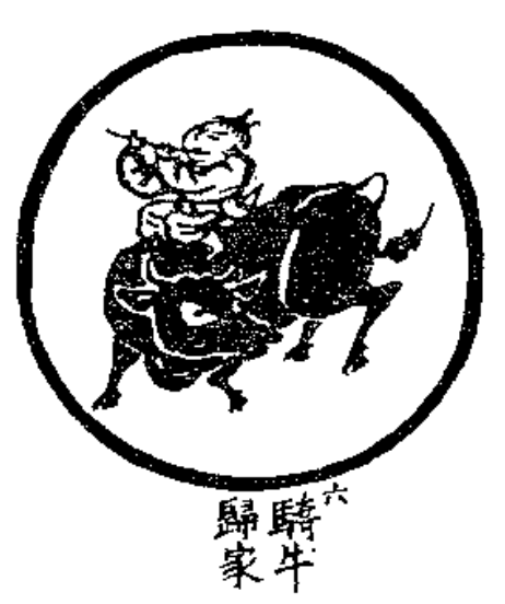
6 - Riding the Bull Home

Once caught, the taming of the bull is achieved by the precision of meditative panoramic awareness and the sharp whip of transcendent knowledge. The Bodhisattva has accomplished the transcendent acts (paramitas) - not dwelling on anything.