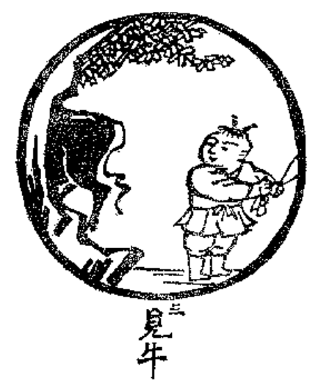
3 - Perceiving the Bull

You are startled at perceiving the bull and then, because there is no longer any mystery, you wonder if it is really there; you perceive its insubstantial quality. When you begin to accept this perception of non-duality, you relax, because you no longer have to defend the existence of your ego. Then you can afford to be open and generous. You begin to see another way of dealing with your projections and that is joy in itself, the first spiritual level of the attainment of the Bodhisattva.