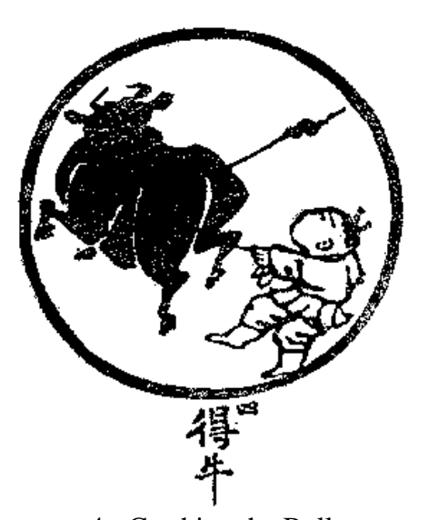
4 - Catching the Bull

You are startled at perceiving the bull and then, because there is no longer any mystery, you wonder if it is really there; you perceive its insubstantial quality. When you begin to accept this perception of non-duality, you relax, because you no longer have to defend the existence of your ego. Then you can afford to be open and generous. You begin to see another way of dealing with your projections and that is joy in itself, the first spiritual level of the attainment of the Bodhisattva.