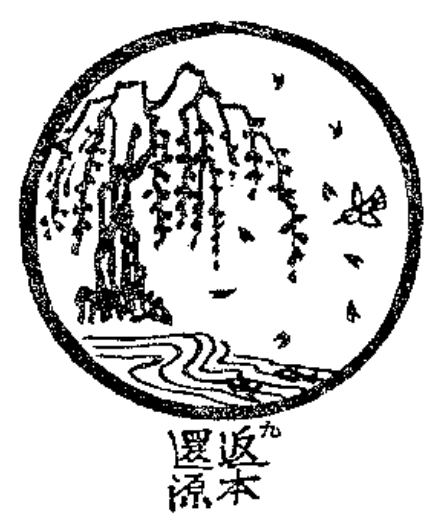
9 - Reaching the Source

Since there is already such space and openness and the total absence of fear, the play of the wisdoms is a natural process. The source of energy which need not be sought is there; it is that you are rich rather than being enriched by something else. Because there is basic warmth as well as basic space, the Buddha activity of compassion is alive and so all communication is creative. It is the source in the sense of being an inexhaustible treasury of Buddha activity. This is, then, the Sambhogakaya.