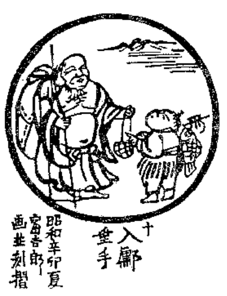
10 - In the World

Since there is already such space and openness and the total absence of fear, the play of the wisdoms is a natural process. The source of energy which need not be sought is there; it is that you are rich rather than being enriched by something else. Because there is basic warmth as well as basic space, the Buddha activity of compassion is alive and so all communication is creative. It is the source in the sense of being an inexhaustible treasury of Buddha activity. This is, then, the Sambhogakaya.